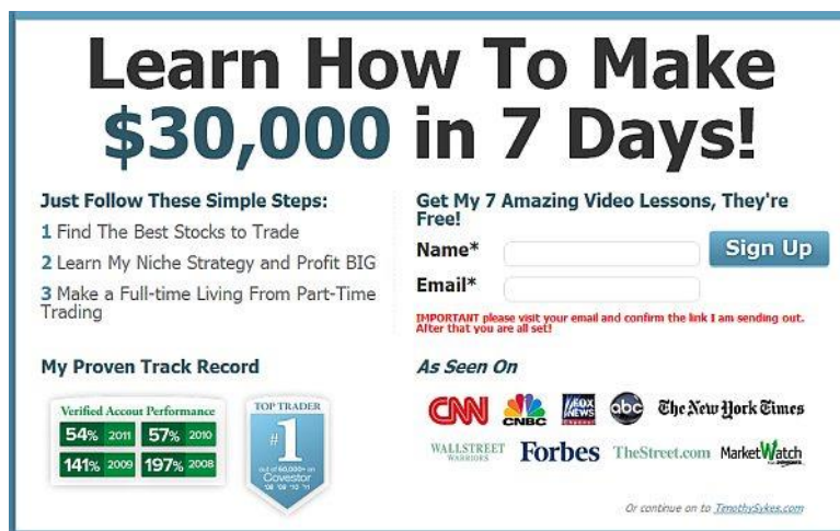
Figure 1 - Example of a Squeeze Page

There are two basic ways to develop a great lead magnet that people who are interested in your niche will want: Develop it yourself or use content that already exists.